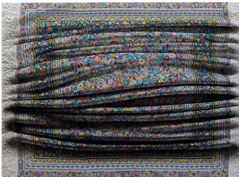
Antonio Santín, Poligamia , 2023

The largest paintings here span over seven feet across and depict geometric and floral patterned rugs in space. Thousands of paint dots mimic the warp and weave of intricate patterns while longer extrusions of paint perfectly impersonate knots and fringes on each side. Taking up to 9 months to complete, the final stage of the process is an application of black glaze that introduces areas of shadow.