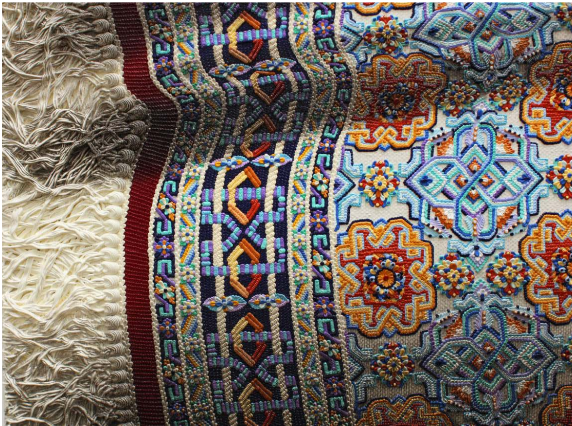
Antonio Santín, I'm Only Happy When It Rains , 2023 (detail)

This month in New York, artist Antonio Santín presents shockingly hyperreal oil paintings that depict life-size undulating ornate rugs. On view at Marc Straus Gallery, each painting is a surprising illusion of a carpet in 3D space, but up close, they're even more impressive. Painstakingly applied with a modified syringe, thousands of tiny brushstrokes demand sustained inspection and a new fascination for both textile and paint.