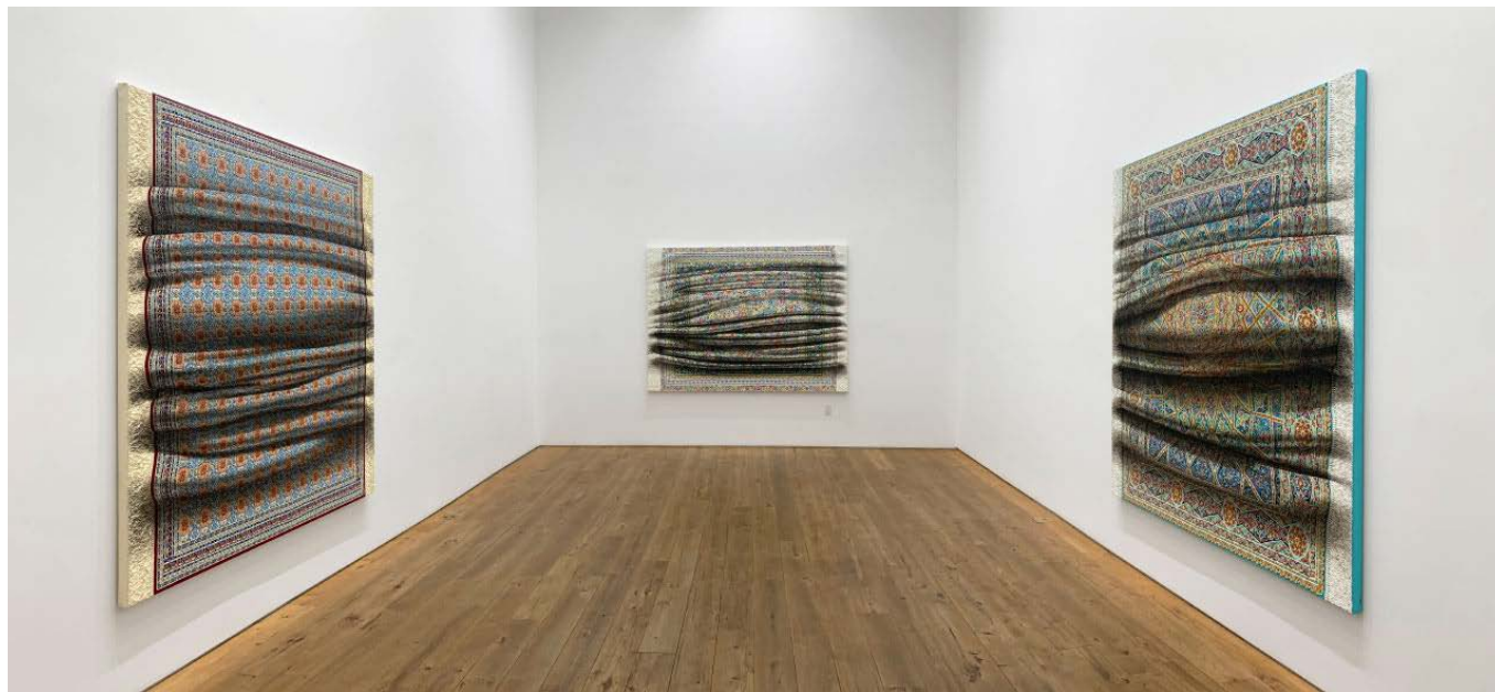
Installation view, Antonio Santín, MARC STRAUS Gallery, New York

The largest paintings here span over seven feet across and depict geometric and floral patterned rugs in space. Thousands of paint dots mimic the warp and weave of intricate patterns while longer extrusions of paint perfectly impersonate knots and fringes on each side. Taking up to 9 months to complete, the final stage of the process is an application of black glaze that introduces areas of shadow.