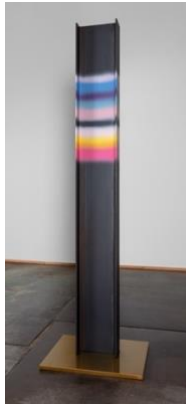
Marie Watt (b. 1967) Skywalker Greets Sunrise, VIII , 2021 Steel I-beam, cold rolled steel cap 96 x 24 x 24 inches (243.84 x 60.96 x 60.96 cm)