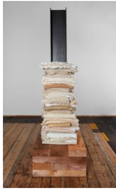
Marie Watt (b. 1967) Skywalker/Skyscraper (Dawn) , 2021 Reclaimed wool blankets, steel I-beam, cedar 104 x 30 x 30 inches (355.6 x 76.2 x 76.2 cm)