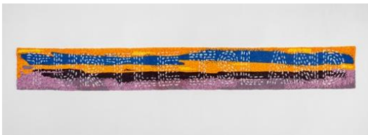
Marie Watt (b. 1967) Companion Species (Envelop) , 2021 Vintage Italian glass beads, industrial felt, thread 13.5 x 112 inches (34.29 x 284.48 cm)