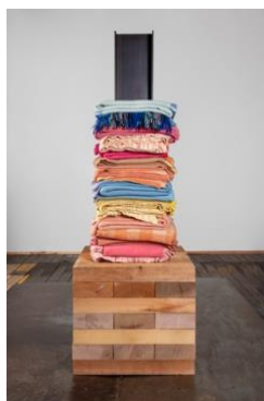
Marie Watt (b. 1967) Skywalker/Skyscraper (Sunrise) , 2021 Reclaimed wool blankets, steel I-beam, cedar 88 x 30 x 30 inches (223.52 x 76.2 x 76.2 cm)