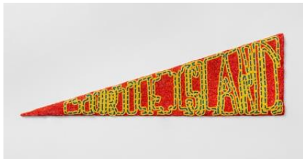
Marie Watt (b. 1967) Companion Species (This Soil) , 2021 Vintage Italian glass beads, industrial felt, thread 12 x 38 inches (30.48 x 96.52 cm)