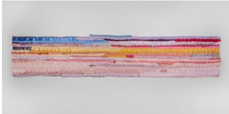
Marie Watt (b. 1967) Companion Species (A Distant Song) , 2021 Reclaimed satin bindings, industrial felt, thread 32.5 x 168 inches (82.55 x 426.72 cm)