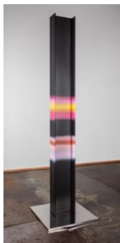
Marie Watt (b. 1967) Skywalker Greets Sunrise, IX , 2021 Steel I-beam, stainless steel 108 x 24 x 24 inches (274.32 x 60.96 x 60.96 cm)