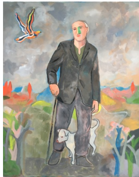
Sandro Chia, The Wayfarer with His Cane (Dog in Italian), 2017 Oil on Canvas, 162 x 130cm

Visit: http://www.marcstraus.com/exhibitions/sandro-chia-feb-15-2017/