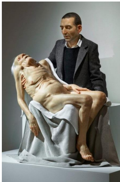
still life (pieta) 2007, mixed media, 160 x 123 x 40 cm