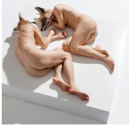
Unsettled Dogs, 2012, silicone, pigment, resin, human hair and fur, 64 x 62 x 23cm, edition of 3 + 2ap