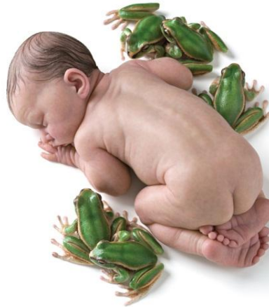
small things, 2012, silicon, human hair and resin, 10 x 36 x 36cm