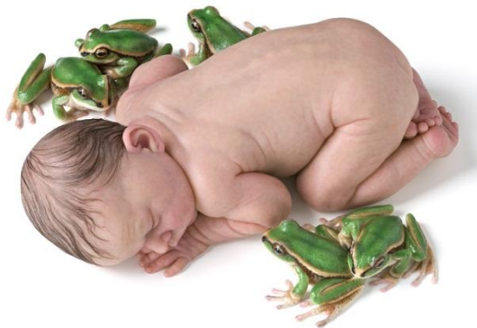
small things, 2012, silicon, human hair and resin, 10 x 36 x 36cm