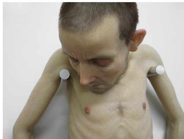
hanging man, 2007, mixed media, 132 x 47 x 27 cm