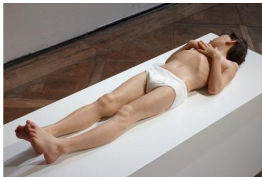
Untitled (boy), 2013, silicone, pigment, resin and human hair, approx 15 x 86 x 24cm

Take a look at the video below for a close look at the artist's creative process, and painstaking hand-work involved in the making of each sculptural representation: