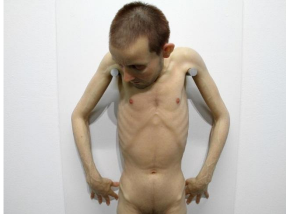
hanging man, 2007, mixed media, 132 x 47 x 27 cm