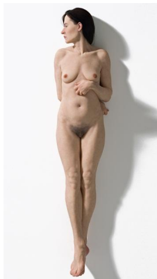
duo, 2008-2010, mixed media, 130 x 28 x 19 cm